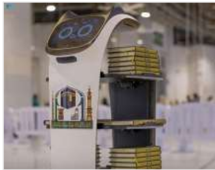
Figure (4): Robots to Distribute Holy Quran to Pilgrims at Grand Mosque

It uses two automatic navigation systems (peace) and a three-dimensional sensor, so it avoids collisions with barriers and people (figure 4). And it is also possible to interact with the robot by touch for a period exceeding (12) hours, through a battery that can be replaced at any time, it takes about four hours to charge it. And the weight of the robot is 59 kg, the speed is 1.2 - 5 m/second (can be controlled), and a capacity of ten kgs, and it reaches the upper limit of 40 kg, the dimensions of the robot are 565 * 537 * 1290 mm (the official Saudi Press Agency, 2022). The first purpose of this robot is to, to eliminate the physical distancing imposed by the COVID-19 pandemic, but now, the robot succeeds in the field of facilities to service the visitors at the two Holy Mosques.