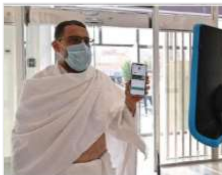
Figure (9): the Security Robot

As part of its commitment to precautionary and preventive measures, this robot follows the applied health systems, which must be followed by pilgrims and workers in Masjid Al-haram. By using artificial intelligence, it can monitor body temperature and how committed the wearer is to wearing the facemask, as well as provide constant purification and sterilization (figure 9). It can also be operated and controlled remotely via the control and monitoring platform (sawahl.com, 2022). This robot, serve the presidency on different sides, such as: monitoring the high number of visitors to check their health and safety and ensure everyone investigates to apply the procedures of preventive health.