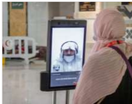
Figure (3): Robots at Makkah’s Grand Mosque Guide Pilgrims with Rituals

Through a 21-inch touch screen, it can be used to create a number of services of interest to those who visit the Grand Mosque, such as guidance, direction, and opinion. There is the option of adding instant translation, remote communication with sheiks, and setting directives in different languages. The remote-controlled robot supports 11 languages including Arabic, English, French, Russian, Persian, Turkish, Chinese, and Bengali. The robot four-wheeled and is equipped with a smart stopping system that allows its smooth and flexible movement, with a system of front and bottom cameras with high accuracy and clarity in image transmission. It allows capturing surrounding photography of the place, headphones with high sound clarity, and a high-quality microphone that allows clear transmission of sound. It works on a wireless network system (Wi-Fi) at a speed of (5) GHz, which enables fast and high data transmission (the official Saudi Press Agency, 2022). All these features, allow the robot to roam among pilgrims, talk to them, answer their inquiries, and easily provide guidance and advice, in addition to performing its role in enhancing communication between individuals during remote work and the physical distancing imposed by the COVID-19 pandemic (figure 3).