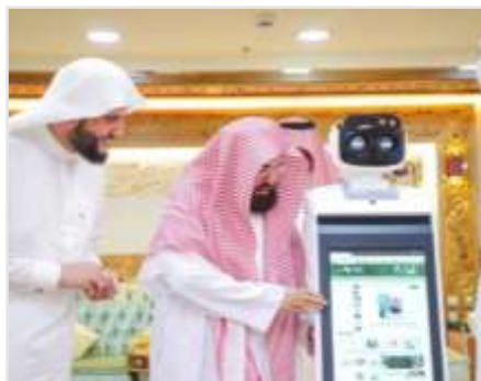
Figure (2): Recitations, Sermons and Azan Robots Launched at Grand Mosque

Another smart technology projects by the presidency dedicated to the Two Holy Mosques to provide improved services to visitors is “recitations, sermons, and azan” robots. Sheikh Dr. Abdulrahman bin Abdulaziz Al-Sudais, President General of the Grand Holy Mosque and Prophet's Holy Mosque Affairs affirmed that:” the robot is concerned with delivering the message of the imams and muezzins of the Grand Mosque to the destinations” (The official Saudi Press Agency, 2021). And Sheikh Dr. Abdulrahman Al-Sudais explained that the work of the robot will be in two parts: where the first part includes displaying the "barcode" of all materials enabling users to download services on smartphones. While the second section operates through press or voice commands in the robot, and the narrator communicates with it automatically, to obtain general information about imams, muezzins, and weekly schedules, including the names of clerics delivering Friday sermons (figure 2). And the robots can recite the Holy Qur'an, sermons, recitations, and azan (arabnews.com, 2022).