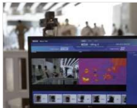
Figure (10): Thermal Cameras for Visual Sorting Operations

In general, thermal cameras can be used to visualize signals that are invisible to the naked eye or to enhance the detection of visible objects in poor visibility conditions (Morgado, 2020). With thermal imaging, it is possible to detect the high body temperature within 9 meters for 25 people at the same time (Dubois, 2020) (Safaa Saud, et al., 2020).