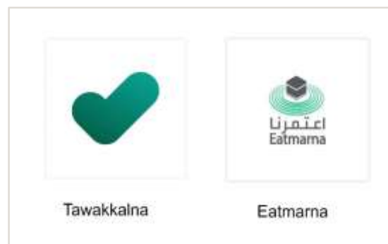
Figure (11): Applications of AI in Smartphones for Enhancing the Preventive and Health Precautions

The Eatmarna app provides services for pilgrims, allowing those wishing to perform Umrah and visit to apply for the issuance of permits to enter the two holy mosques for Umrah, visit, and prayer. In proportion to the capacity approved by the relevant authorities to ensure the provision of a Safe mental atmosphere combined with the Tawakkalna app enabling adequate health and organizational preventive procedures and controls to ensure the integrity of the permit applicant's health status (my.gov.sa, n.d). The Eatmarna app effectively provides a safe environment for pilgrims (Hassan et al., 2022).