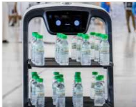
Figure (1): Robot for Distributing Zamzam Water

The Zamzam water dispensing robot dispenses (30) packages per round with a capacity of 23.8 liters. The robot works from (5-8) hours without human intervention and is easy to handle. The robot used upper and lower cameras and laser sensors to scan the domain in front of it (figure 1). To avoiding all kinds of obstacles if exist (The official Saudi Press Agency, 2022). The robot for distributing Zamzam water has been patented by Simultaneous Localization and Mapping (SLAM), with a high-performance atomization unit, an early warning feature with voice broadcast at the required time. They have a fast and energy-saving battery charging feature (Fatima, 2021).