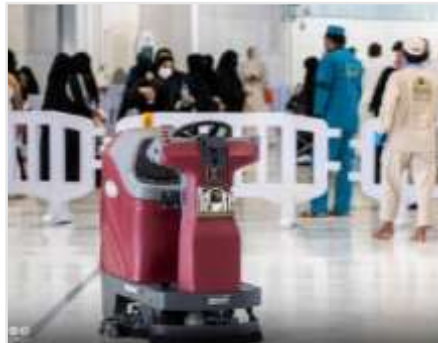
Figure (7): the Robot for Performs Floor Washing and Disinfection Operations

This robot was distinguished from other robots by various equipment and features, in pursuit of the Presidency to reach the highest standards of safety in the two holy mosques and to preserve the safety and health of worshipers, Umrah, and pilgrims.