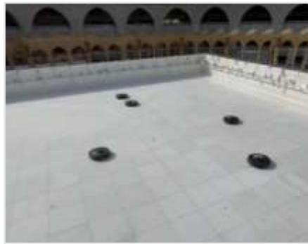
Figure (5): Robot Vacuums Used to Clean, Sanitize Roof of Holy Kaaba