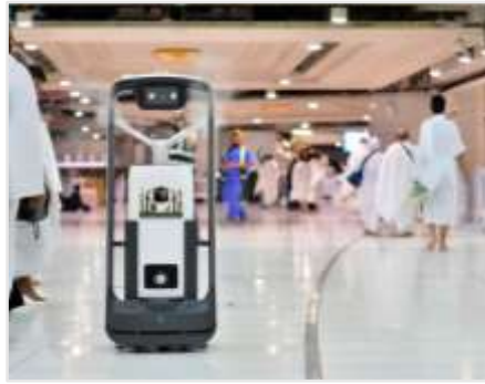
Figure (8): the Robot for Sterilizing